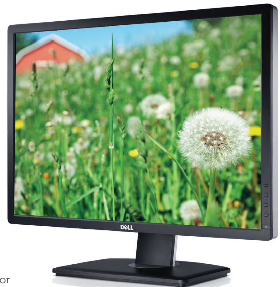
Dell UltraSharp™ U2412M 24" Monitor